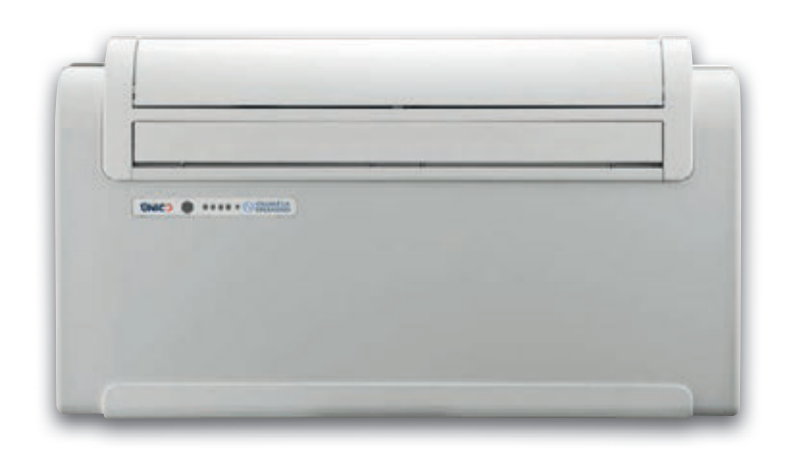
Design by King e Miranda